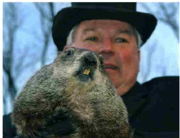
Guest speaker for February meeting is unfortunately under house arrest near Wiarnton.